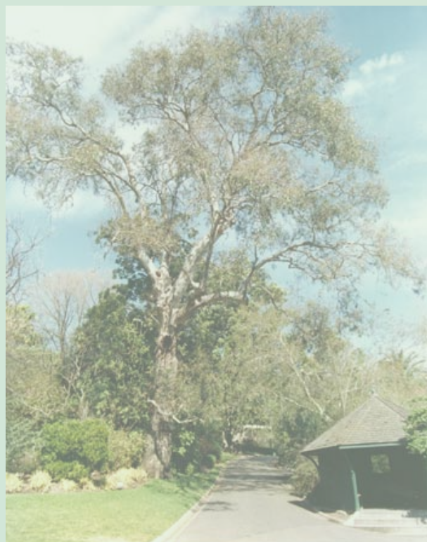
'The Separation Tree', Eucalyptus Camaldulensis , Royal Botanic Gardens, Melbourne