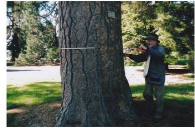
Measuring the circumference of Pinus ponderosa