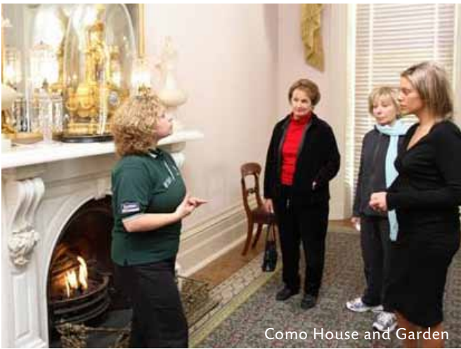
Como House and Garden