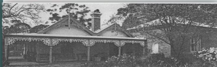
'HARD HILL' 57 Green Street, California Gully.

In support of the Bendigo Branch of the National Trust